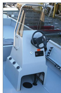
Optional Center Console

AMERICAN ANGLER PROUDLY OFFERS THE ENGINE OF YOUR CHOICE: