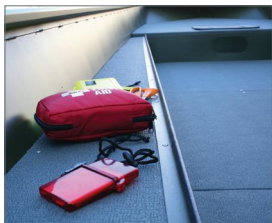
Full Length Tackle Trays

At a glance, the Sportsman Series by Smokercraft is a no-nonsense all-welded open boat. Look closer and you'll find a serious sport and fishing machine that's ideally suited to shallow river jet boating, bass fishing, hunting, drifting for steelhead, trolling for salmon, a casting platform for trout or a cargo barge for an extended backcountry excursion. Ideal for either jet or prop outboards, it doesn't take much to power this shallow draft V-hull. The wide-open design affords ample interior space...something you'll appreciate when a fish is running you around the boat. The relative simplicity of the Sportsman is its greatest virtue. Strong, unobstructed and thoughtfully designed it has everything you need, like a built-in fuel tank and exactly what you don't need... a heavy price tag.